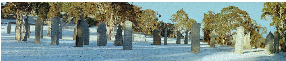
Australian Celtic Standing Stones, Glen Innes