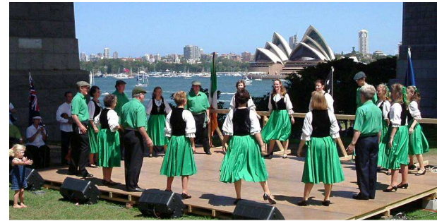
Australia Day Celtic Festival